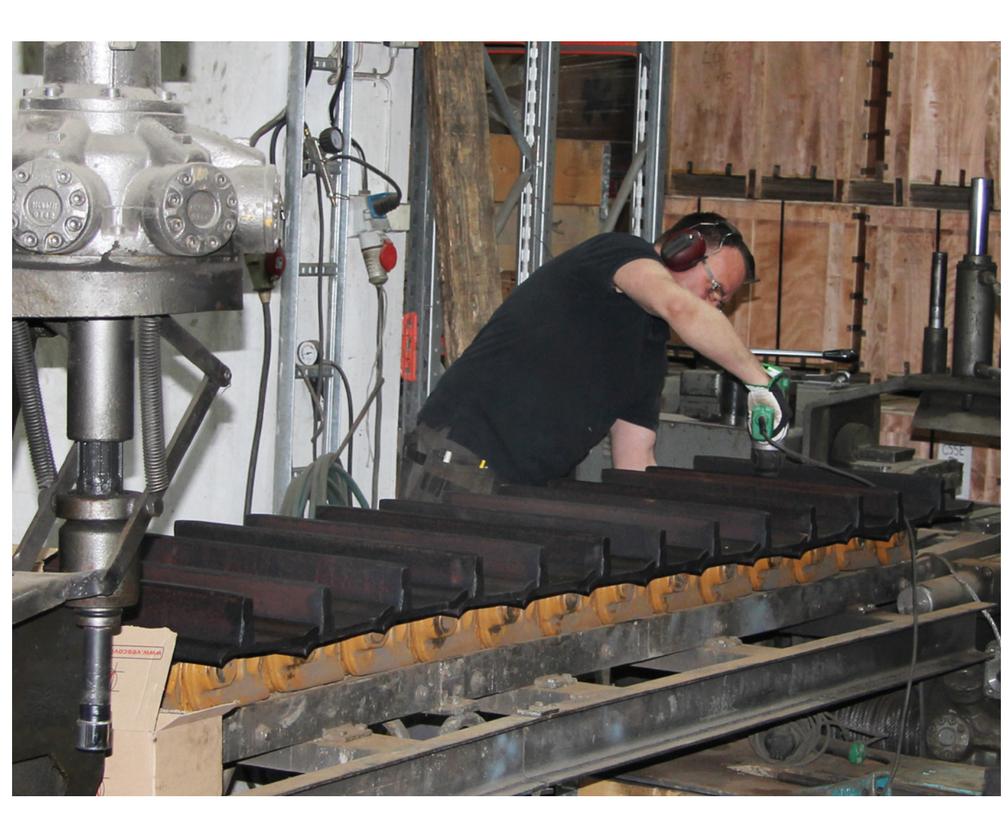
We assemble the track shoes in-house to guarantee the quality. We also move your old shoes to new chains for renovations.